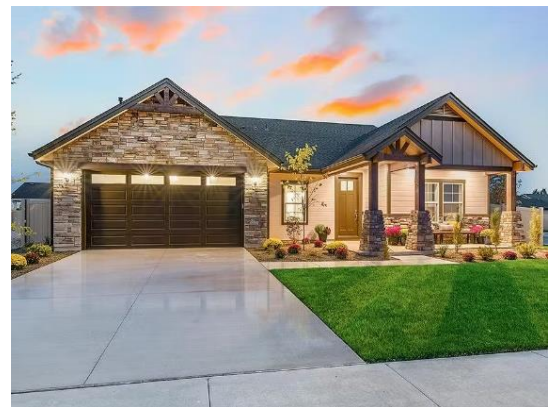
Sekisui House's growing US homebuilder business